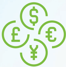
Local and Foreign Currency Accounts

We nurture a culture that focuses on serving and growing our customers who range from institutional, commercial to individual customers. We do this through customized banking services: