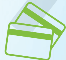
Kenya Shilling & US Dollar Credit Cards

You may access our services across the largest branch network in the region with 598 branches, 1,318 ATMs and over 33,393 merchants and agents offering banking services on a 24/7 basis in East Africa. This is complemented by mobile banking and internet banking services with 24-hour contact center services for our customers to get in touch with the Bank.